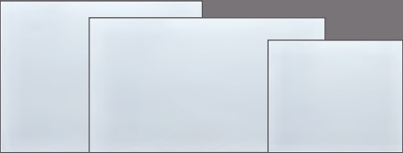
27” x 36” Corian™ Tabletop